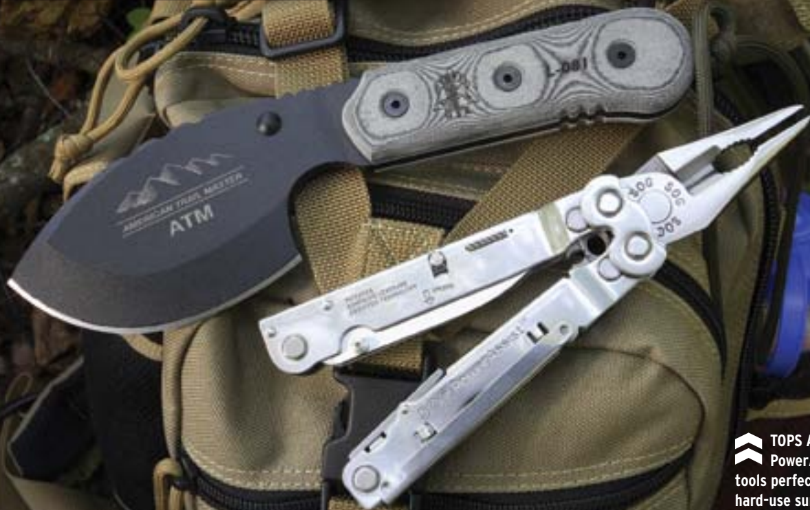
TOPS ATM and SOG PowerAssist are two tools perfectly suited for hard-use survival and bug-out bags.