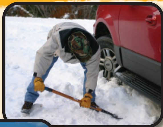
Above: A stranded motorist uses a shovel to free his 4WD vehicle after a snow storm in the Cascade Mountains.