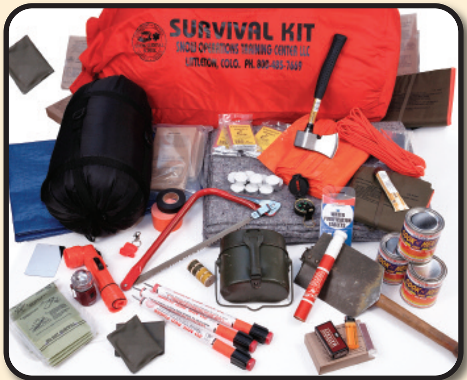
The Safety One Vehicle Survival Kit with all of its components.

While most of the "yuppie" SUV crowd demand their factory-equipped vehicles have cool electronic gadgets, numerous cup holders, and DVD players to appease their undisciplined kids, the folks where I come from believe that jumper cables, tow chains, hand tools and basic survival gear should be standard equipment. Add to that a first-aid kit, fire extinguisher, machete, wool blanket, waterproof jacket, large Maglite, Glock 27, a few extra packs of cigarettes, and a water jug and you've got my basic kit that goes anywhere my pickup truck rolls. A while back I was traveling through southern Arizona along the Mexican border and I got to thinking: If I got stranded on these desolate roads void of cell phone service or other humans would I have enough gear to survive? While most of us politically incorrect survivalists know the gear we should have, very few actually take the time to put together a good vehicle kit. And while I'm one of those who believes good skills will always take you further than good equipment, taking the time to put together a vehicle kit could save you a ton of misery if and when you get stranded. We need not look any further than the death of James Kim in Oregon after he and his family became stranded in their vehicle in mountain snow, or all the folks who were stuck on an icy Pennsylvania interstate to realize that a vehicle survival kit should be considered a necessity – just like gas in the tank.